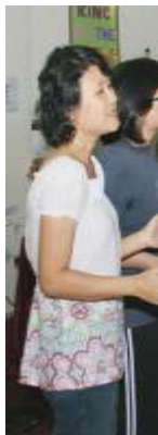
Christmas gift of: Exceeding Joy

Complimenting the children's skit, our next section of the program focussed our guests to the Christmas' gifts, which Jesus could give to those who want it through Him - Unconditional love, Peace, Joy, and most of all, THE GREATEST GIFT - ETERNAL LIFE.